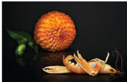
Photographer Agniet Snoep’s images were introduced at DC’s (e)merge art fair.

Leigh Conner of Connersmith ( connersmith.us.com ) gives us her picks for contemporary art’s rising superstars.